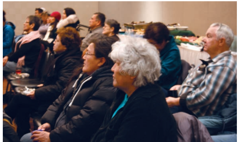
Shareholders at the Fairbanks Dialogue with Doyon meeting.

Upcoming meetings will take place in Tanacross and in Portland, Ore. Meetings will also be held in McGrath and Anvik in early 2012. Please watch the Doyon website, www.doyon.com , Facebook page, www.facebook.com/doyonlimited , or newsletter for details as they are confirmed.